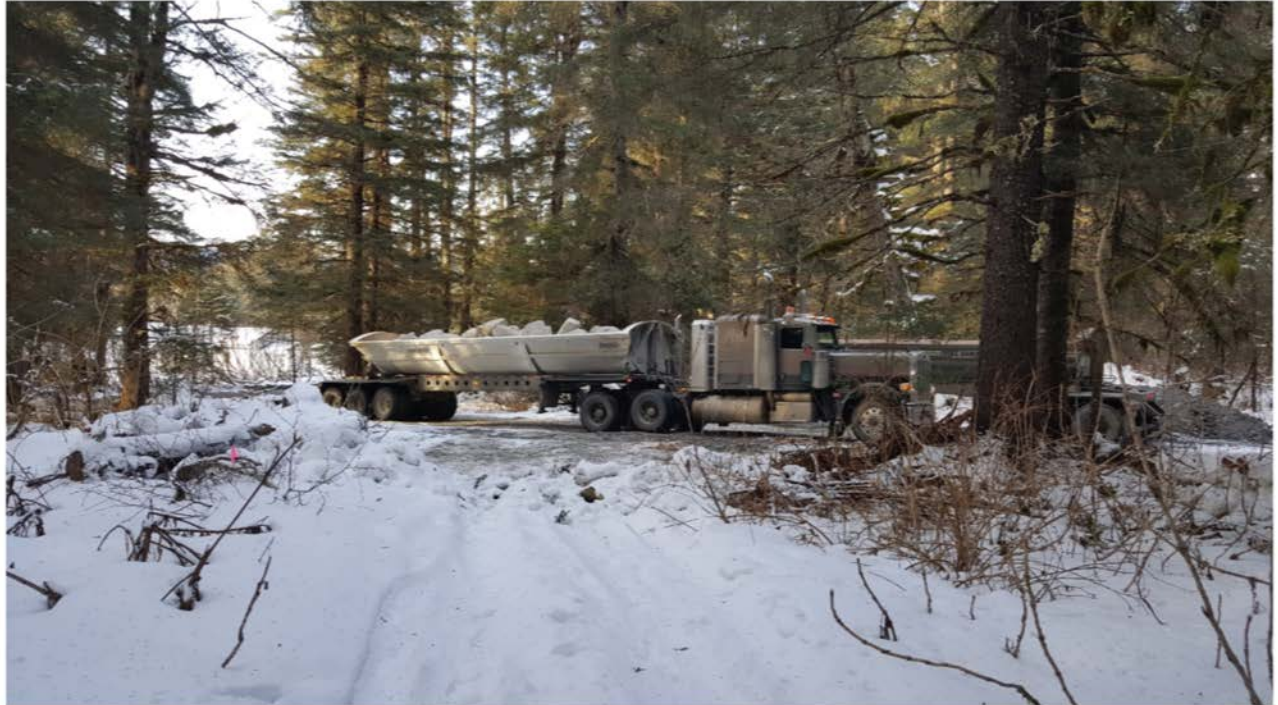
Salmon Creek Revetment Armor Rock February 23, 2018

Sea View Plaza Building 302 Railway Ave, Suite 122 Seward, Alaska 6:00 PM