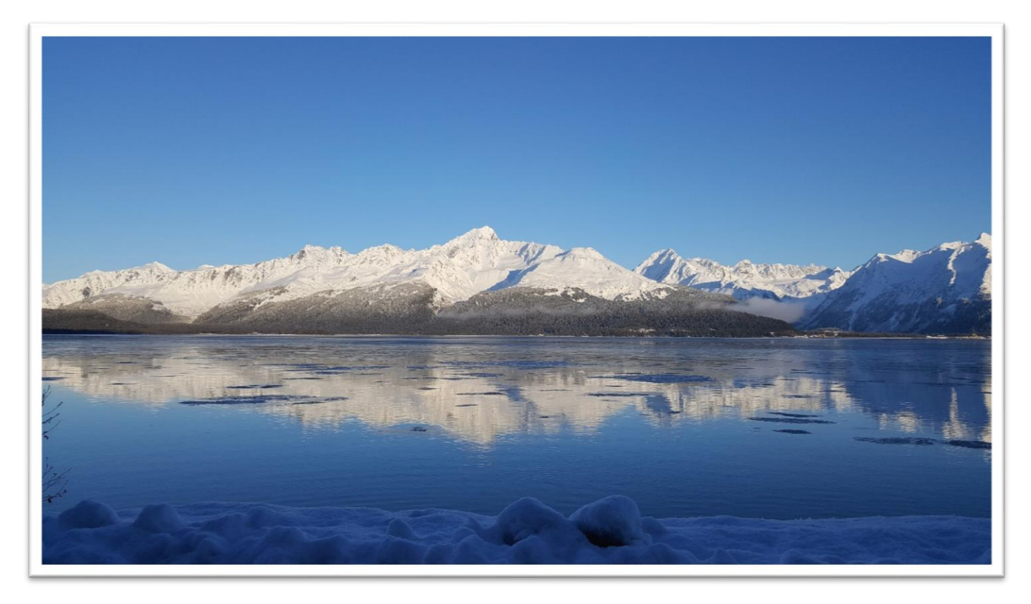
Mt. Alice & Resurrection Bay, February 1, 2017

Sea View Plaza Building 302 Railway Ave, Suite 122 Seward, Alaska 6:00 PM